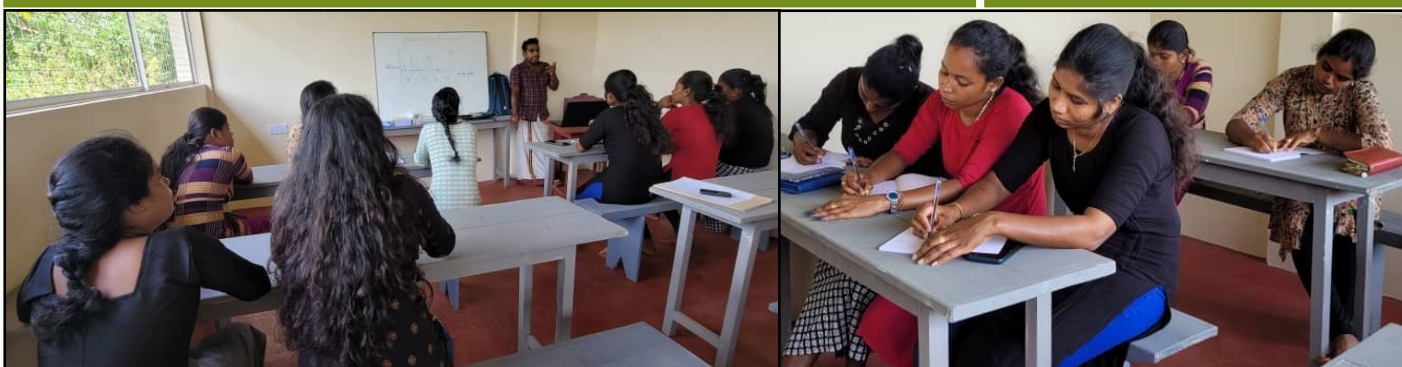
Training sessions being held at Varuthalaivilan Youth League Centre for project participants.

The total estimated project cost is Rs 2,417,460. Of this, 97% has been received or pledged to date. After a training period of 12 weeks, beneficiaries will be accompanied for 9 months to ensure viability of initiatives.